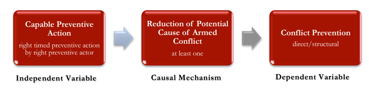
Figure 2: Causal Diagram of Conflict Prevention.

In other words, in order to analyze and understand the conflict preventive effects of preventive actions, it is first of all necessary to identify the causal mechanism which links these actions to the reduction of a certain cause or even numerous causes of armed conflict. How this general approach of conflict prevention translates to the specific effects of CSBMs as a structural tool of conflict prevention shall be discussed in the subsequent section of this article.