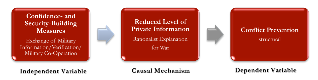
Figure 3: Causal diagram of CSBMs as a Tool of Structural Conflict Prevention.

In sum, the conflict preventing nature of CSBMs can be summarized in the following causal diagram: