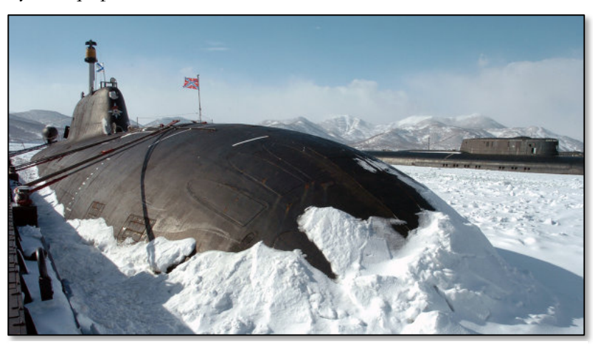
Figure 4 : A Russian nuclear submarine vessel in its home port.

already consider today that the melting environment and the associated increase in the general temperature levels, might open up the Arctic for more different categories of conventional weapon systems, even though they are by today not able to operate in the area (Lind 2014; Wezeman 2014).