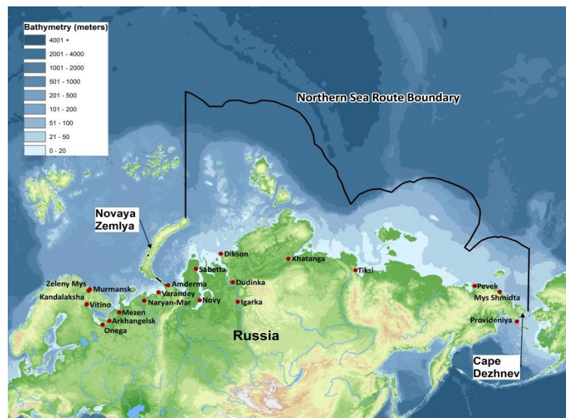
Figure 2: Image created to author's specifications by Fei Carnes of Harvard University's Center for Geographic Analysis using ArcGIS.

Still, the NSR remains tempting, particularly given the unexpectedly rapid warming of the northern cryosphere. A 2007 study examining data from 1953-2006 found that Arctic sea ice had disappeared at a rate even faster than the most pessimistic models had earlier predicted (Stroeve, Holland, Meier, Scambos, & Serreze, 2007), and the overall trend has shown no signs of abating since then. Indicative of this, although ice levels fluctuate year-to-year and seasonal measurements are imperfectly correlated, in 2012 Arctic sea ice registered the lowest summer level observed since satellite monitoring began in 1979, while 2016 witnessed a new winter low, besting the previous record established in 2015 ("Daily Sea Ice," 2016). However, it is not just the extent of the ice cover that is decreasing; as melting intensifies during now-warmer Arctic summers, the ice that reforms in the colder months is increasingly becoming thinner and easier to navigate than multi-year ice, raising the possibility that the NSR could someday remain open year-round. 19 In any case, if declines continue at the present rate, Arctic waters may witness virtually ice-free summers before mid-century (Overland & Wang, 2013).