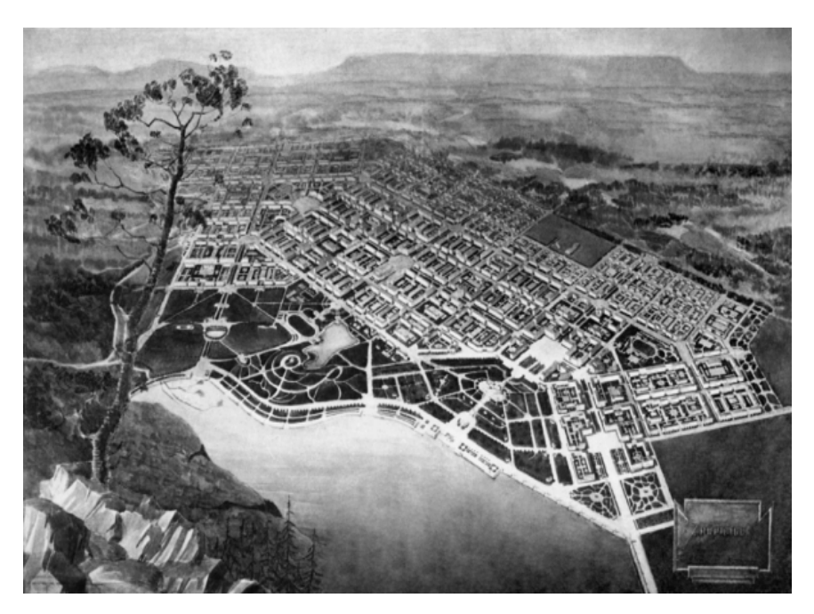
Figure 2. Master plan for the city of Norilsk (c.1939)