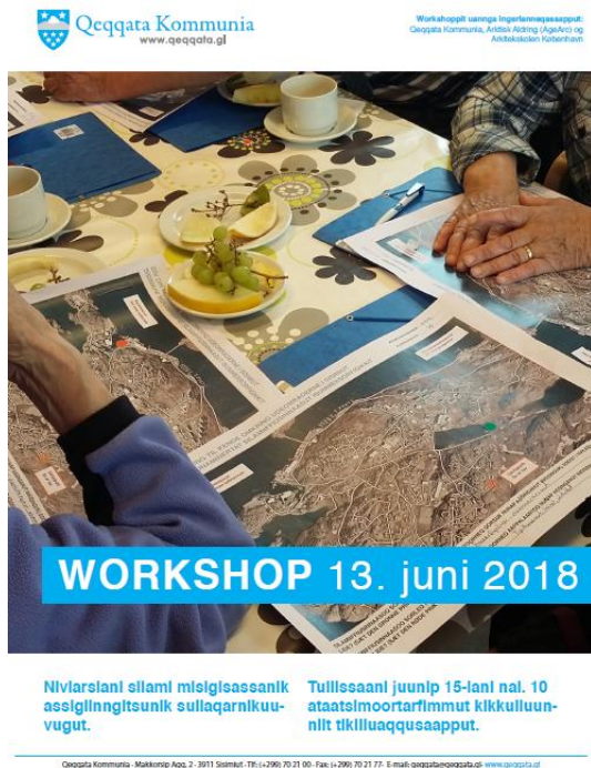
Figures 3-5. Workshop process posters, created by Sidse Carrol.