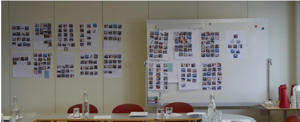
Figure 2: The posters produced during one of the municipal workshops in May 2017.