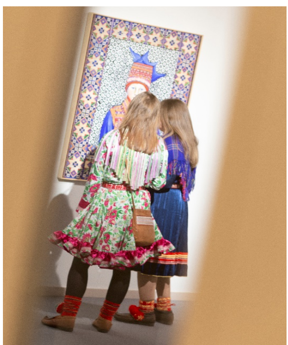
Photo series 2 : Alison Aune, Sky , 2016, acrylic and paper on canvas, 91 cm x 121 cm.

The Transactions and Impulsions exhibition presented art mostly from contexts of art-based research and art-based educational research by selected ASAD members. A wide range of artistic media were implemented: the exhibition covered installations, media art, photographs, video art, textile art and posters. The curators Hiltunen and Haanpää stated that the artworks reflect the ecocultural shift following climate change and other Arctic megatrends as well as the roles of artists, designers and art educators in supporting people in the Arctic: