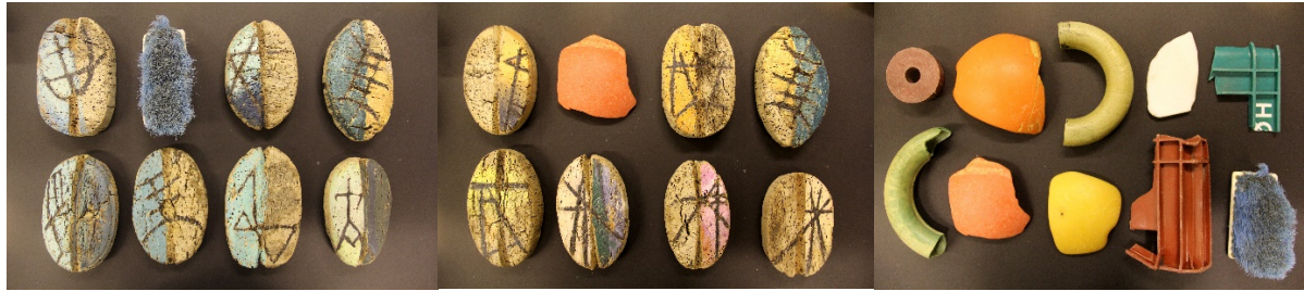
Photo series 3 : Timo Jokela, 30 Years' Walk at Varangerfjord, 2018, installation: found objects, cork and plastic (600 \times 60 \times 30 \text{ cm}) .